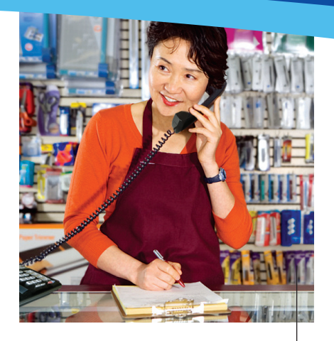
SIP trunking lets you take advantage of VoIP technology to reduce recurring phone carrier charges, which means the Office Serv 7030 can pay for itself over time.

Samsung's mission is to level the playing field for small to midsized businesses by making enterprise-quality telecommunications technologies more accessible and more affordable. Real choices, real technology, and real service—they all come together to enable you to experience The Samsung Advantage.